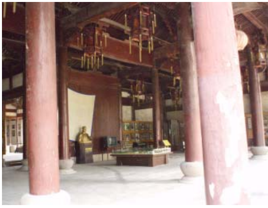
Grand Hall in the palace of Attendant King (Li Shixian), commander of the Taiping Rebellion forces in Zhejiang

rounding landscape, Bayong Tower was a favorite site that was visited by travelers and notables through the centuries. Literary persons invariably took the opportunity to write a poem on the occasion of visiting the tower. But the poem that has become the