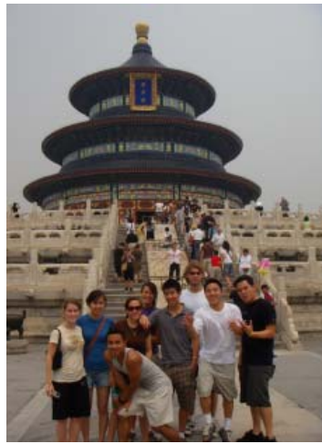
Students at the Temple of Heaven

A 10-day trip was taken by ten students in the 9th Summer China Trip. The program included three weeks of intensive study of Chinese language at Nanjing Normal University and one-week tour to Shanghai and Beijing. Information about this program can be obtained by emailing guan@eastasian.ucsb.edu .