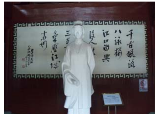
Statue of Li Qingzhao at the Memorial Hall in Jinhua, Zhejiang. Behind is her poem on the Bayong Tower

The Li Qingzhao Memorial Hall in Jinhua is attached to Bayong Tower, an ancient structure that is situated at the remnants of the ancient city wall, overlooking the river that flows through the modern city. Owing to its commanding view of the sur-