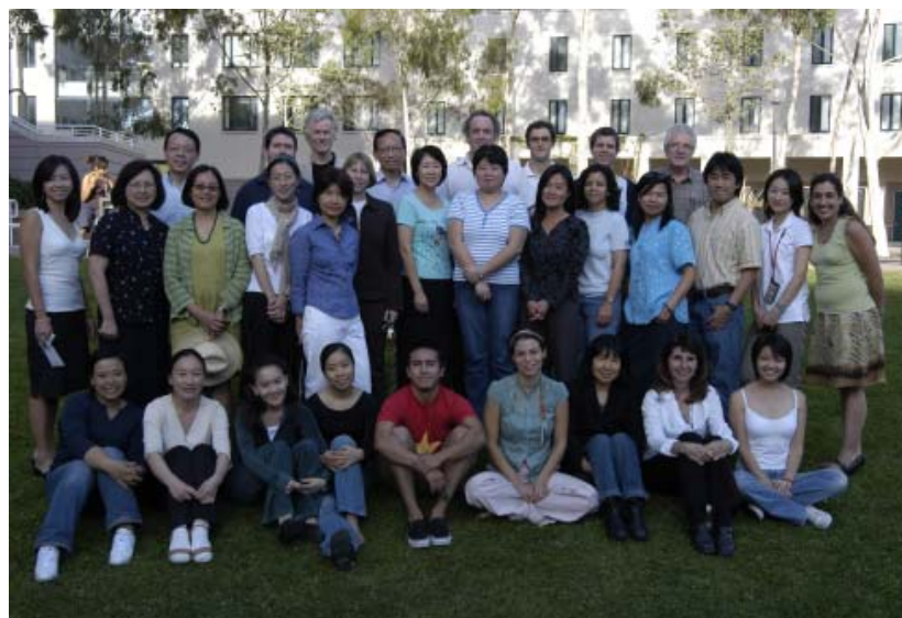
Faculty, staff, and students from the Department of East Asian Languages and Cultural Studies at UCSB, 2007